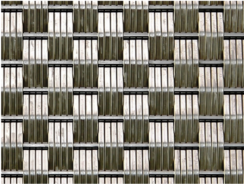
Pattern Name: KEYSTONE