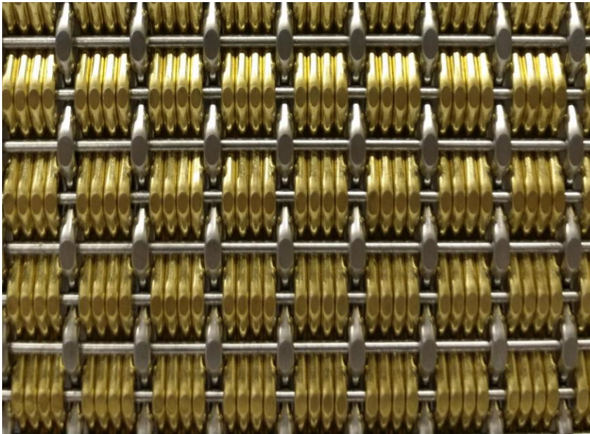
Pattern Name: DATUM